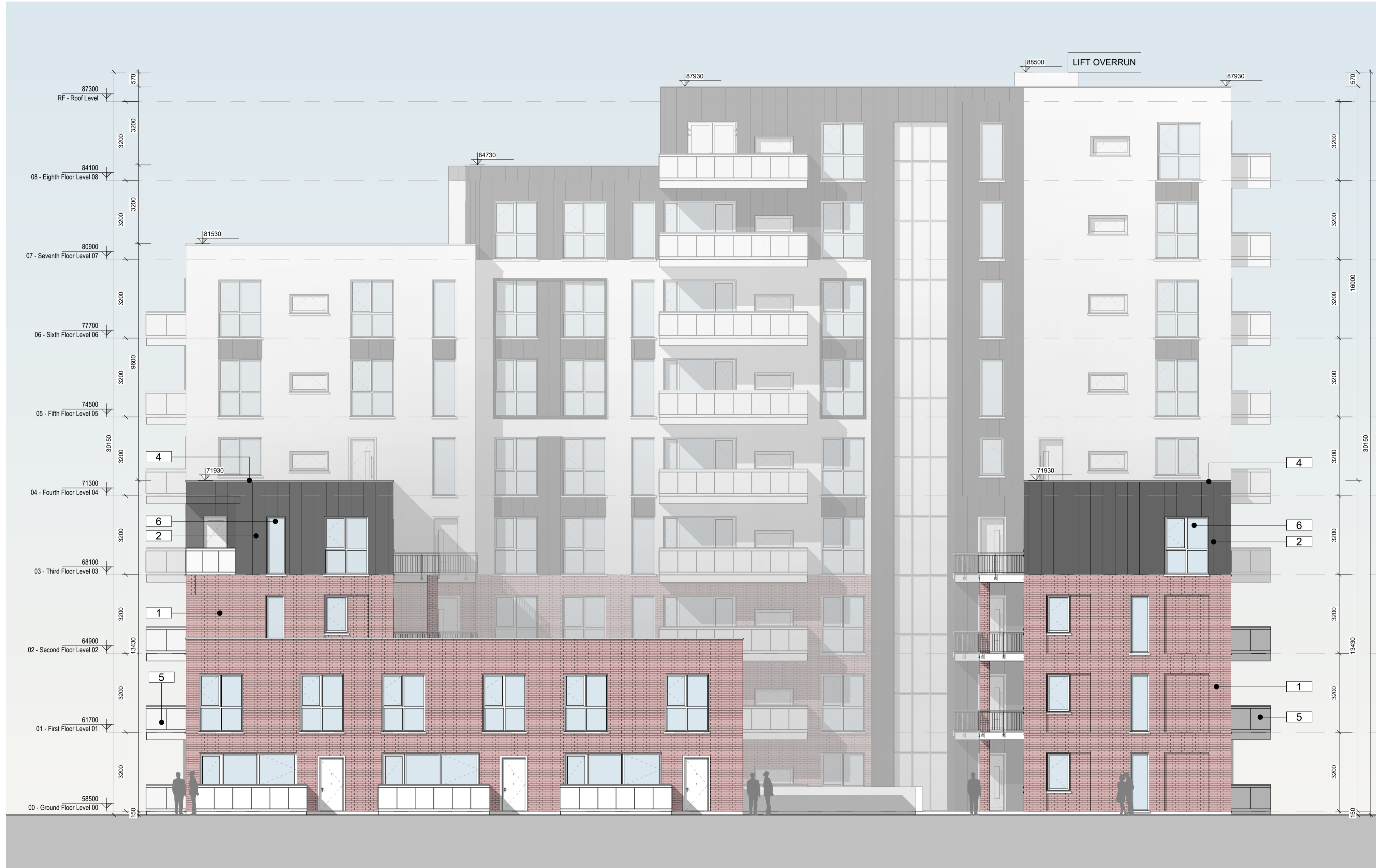
1 West Elevation